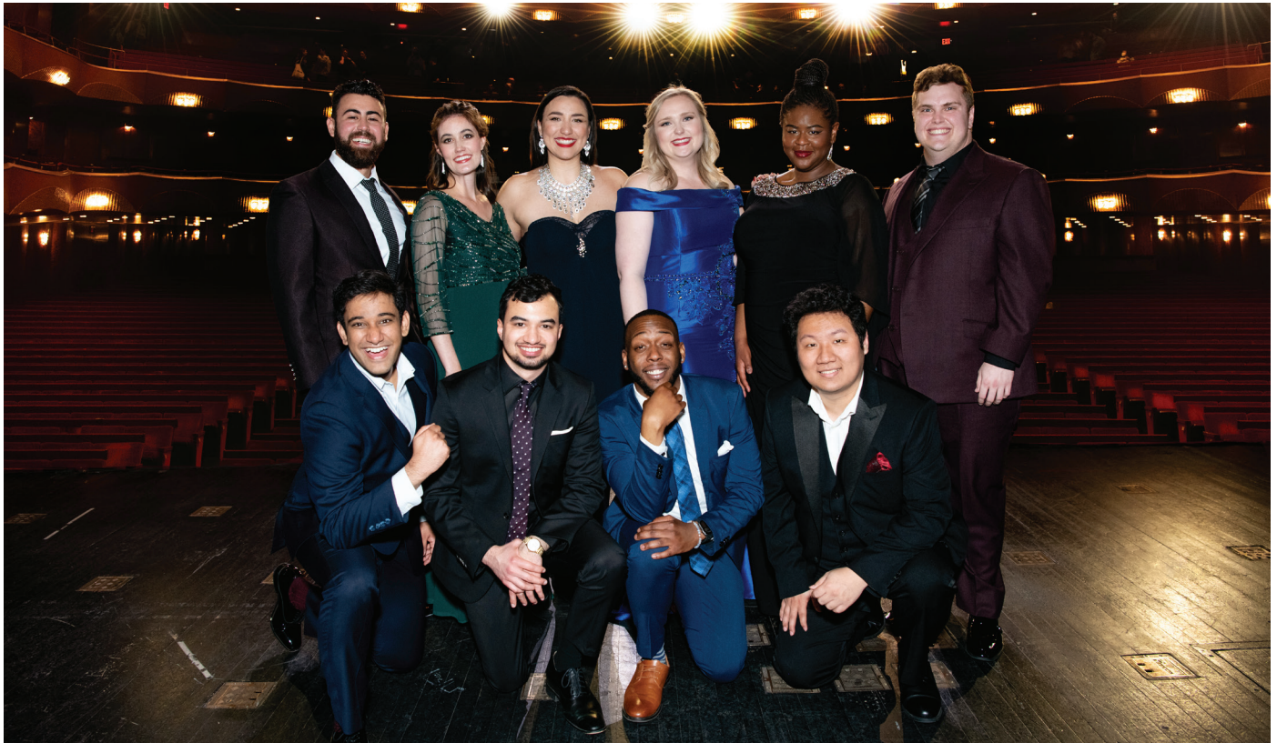
The 2023 Laffont Grand Finalists