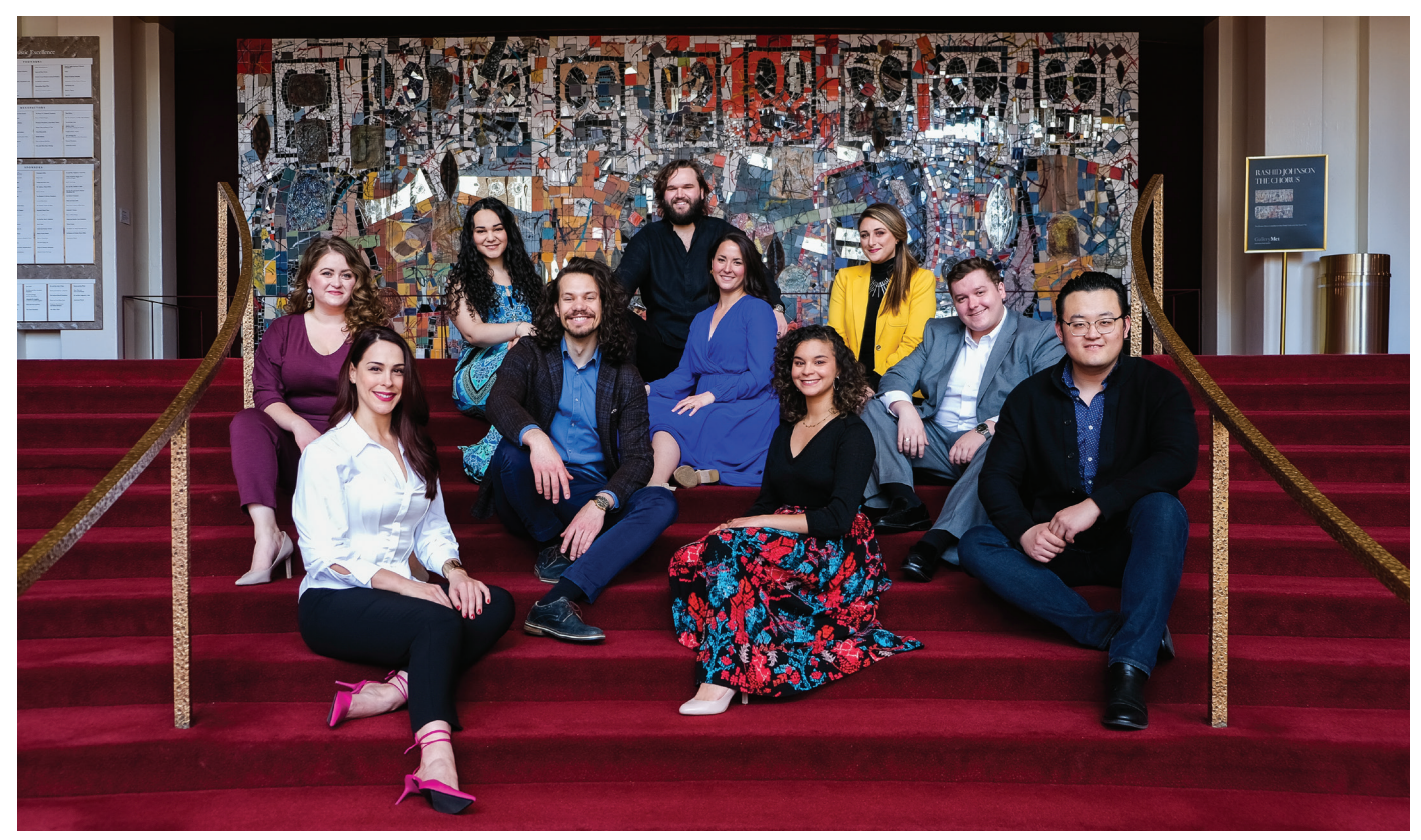
The 2022 Laffont Grand Finalists